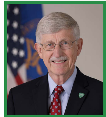
Francis S. Collins, M.D., Ph.D.

In 2015, the Sexual & Gender Minority Research Office (SGMRO) was established to expand the National Institutes of Health (NIH) research activities in sexual and gender minority (SGM) populations, remove related systemic barriers, encourage a robust and engaged SGM research workforce, and evaluate progress made on the goals of the NIH FY 2016–2020 Strategic Plan to Advance Research on the Health and Well-being of Sexual and Gender Minorities . Since its inception, the SGMRO has worked diligently with NIH's Institutes, Centers, and Offices to pursue the goals of this plan.